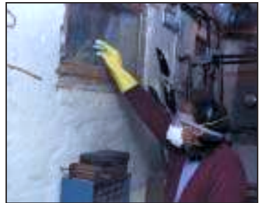
Cleaning while wearing N-95 respirator, gloves, and goggles.

How do I know when the remediation or cleanup is finished? You must have completely fixed the water or moisture problem before the cleanup or remediation can be considered finished.